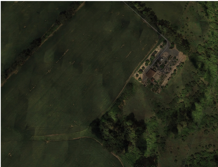
Sunlight @ 7 p.m. Zoom in - Air Quality Monitoring Station