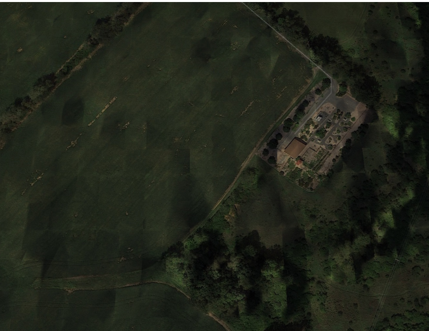
Sunlight @ 7 a.m. Zoom in - Air Quality Monitoring Station